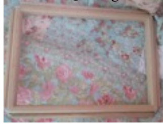
Wooden Quilting Frame